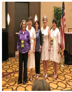
The 2017-2019 Louisiana State Officers